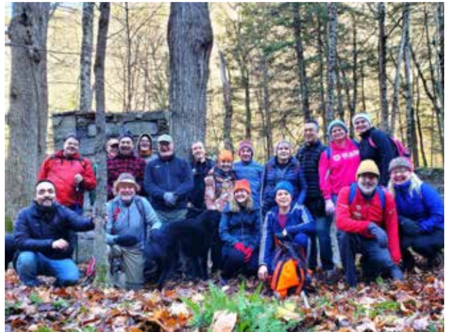
Hike to the Rich Lumber Co. switchback in Lye Brook Wilderness on November 2, 2019