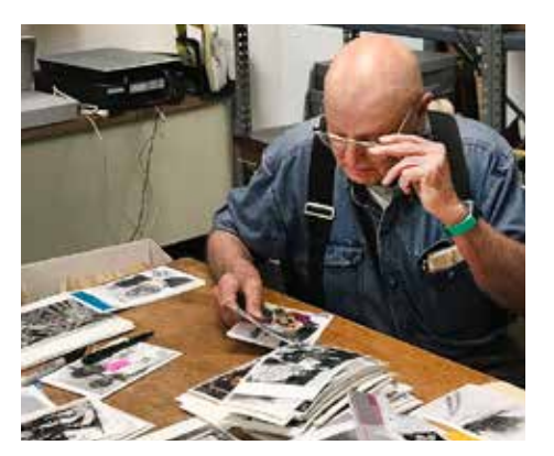
We are preserving the 'genealogy' of the town and the remarkable people who brought Manchester to life. It's living an adventure 'to be continued' for the future. I really enjoy my small part in the activity.